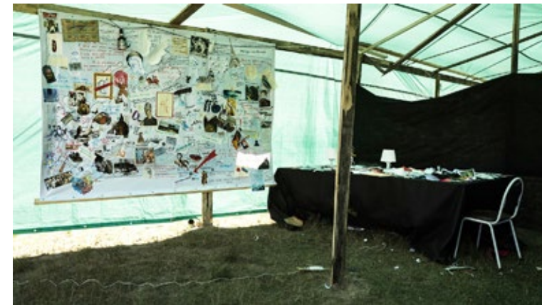
The second room in the Land of the dead, with the Map of Russian Soul billboard.